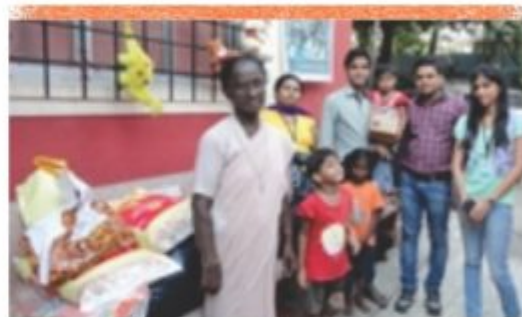
Donation made to 'Prem Sadan'