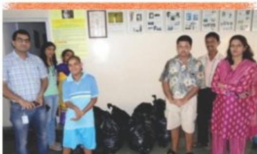
Donation made to 'Shanti Daan'