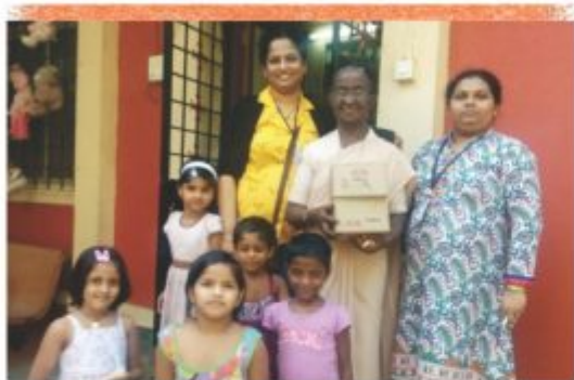
At Prem Sadan

The team at Corporate Office, Mumbai distributed cakes to the young children of our community. This activity was carried out on occasion of New Year 2015 at Nyanvardhini School, a school for children from economically-backward families as well as Prem Sadan, a home for orphan girls in Mumbai.