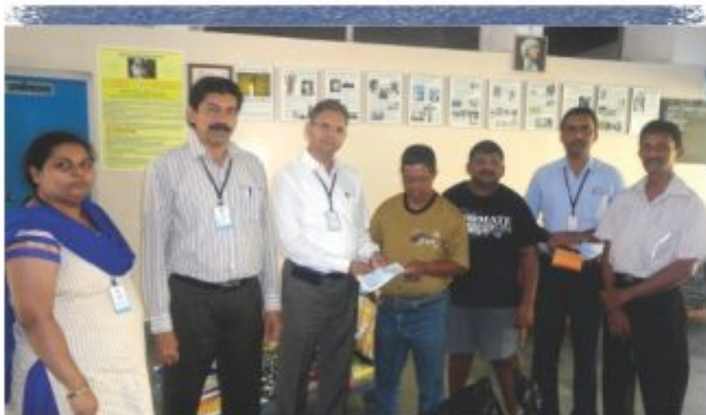
At Shanti Daan

Assisi Bhavan located at Goregoan is home to old age citizens mostly women.