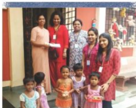
Cheque to Prem Sadan inmates