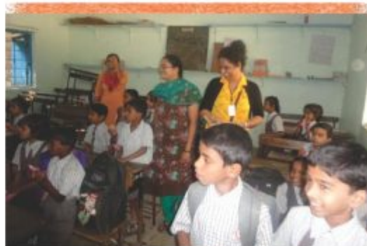
At Nyanvardhini School