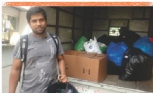
Donation made to 'Making the Difference' foundation