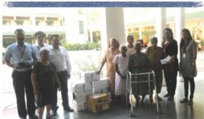
At Assisi Bhavan