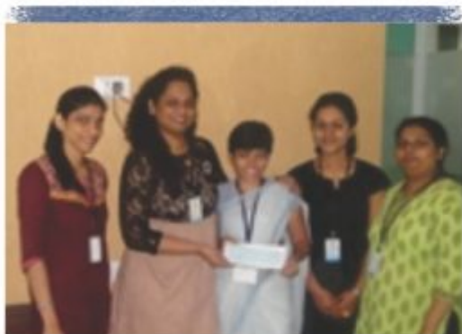
Cheque to Naisargik Shikshan Sanstha