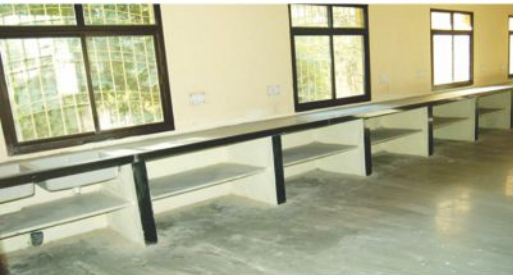
Interiors of Practical Lab ITI college, Ratlam supported by Ipca