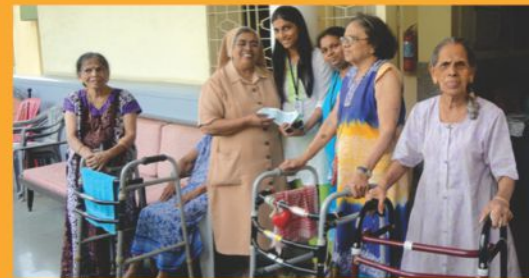
Assisi Bhavan Senior citizens with Ipca Team

A small contribution towards encouraging the senior citizens at Assisi Bhavan- the home for the aged, Mumbai, was made in June, 2015. An amount of ₹ 30,000/- was given to the old age home for purchase of Sewing Machine and for their monthly groceries. Along with the contribution, chocolates were distributed to satisfy sweet tooth cravings.