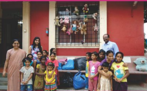
@ Prem Sadan