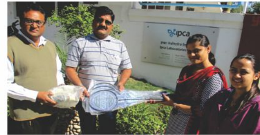
Sports equipments given to the students

अमलेटा हाईस्कूल के बच्चों को सरकार द्वारा प्रदान की गई साईकले, धूप एवं बारिश मे खराब न हो इसलिए इफ्का द्वारा हाईस्कूल में साईकिल स्टैंड का निर्माण किया गया। साथ ही पीने के पानी की टंकी से स्कूल तक पाईप लाईन का सामान प्रदान किया गया।