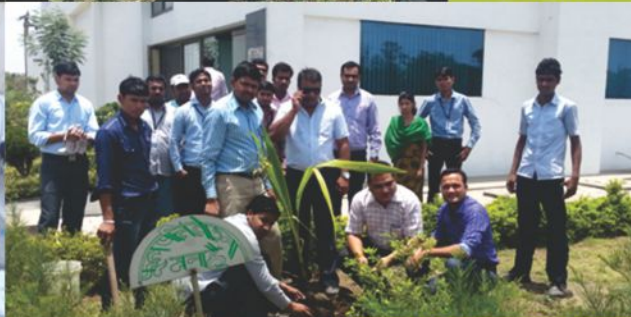
@ Pithampur HPD