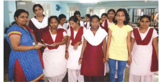
Inmates of K.D.Vora Industrial Home along with Ipca CSR Team

A contribution was made to K.D.Vora Industrial Home for Blind Women, Mumbai which shelters 35 inmates in October 2015 . An amount of ₹ 50,000/- was given to this Home for the purchase of Water Tank towards welfare facility at the hostel building for their usage.