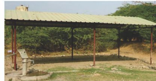
Cycle stand donated by Ipca