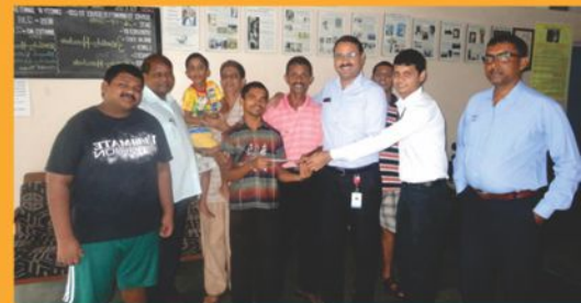
Ipca Team with the inmates of Shanti Daan

Medical Assistance of ₹ 30,000/- was given to Shanti Daan Ashram inmates in July 2015, towards terminally ill and physically disabled males residing in this ashram.