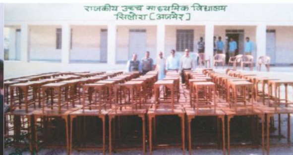
100 tables and stools