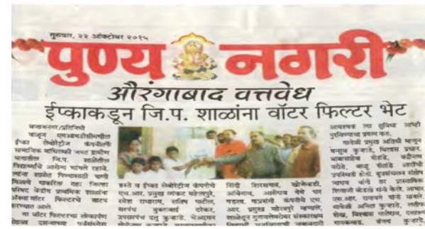
Article published in newspaper

Above mentioned are the schools that are located in Gangapur Taluka, Dist. Aurangabad.