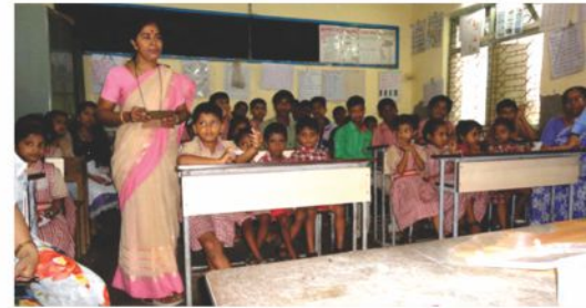
With the children @ school

To promote education and create awareness among the children, notebooks were distributed to the inmates of this school in October 2015. Pragati Vidhyalaya is a municipal school located at Gorai, Mumbai. This school consists of students from slum areas belonging to economically backward families. Approx. 300+ students are currently studying in this school.