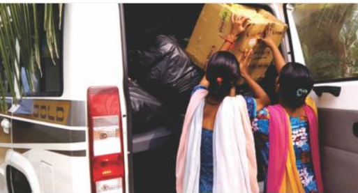
Girls collecting the donated items