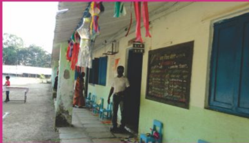
Display of articles prepared by children

November 2015 on Children's Day, CSR team of Mumbai planned an activity to bring smiles on these innocent faces from the slum, who are less fortunate. Thus to promote education, notebooks were distributed to Nyanvardhini Vidhyalaya students. Few fun activities were also initiated to have delightful celebrations and gifts were distributed to the winners. Children also participated and involved themselves with full enthusiasm.