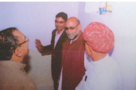
Facilities for girl students