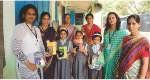
@ Nyanvardhini Vidhyalaya